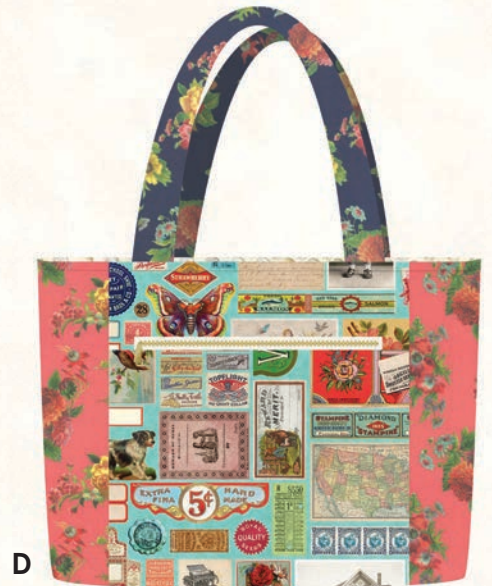
A AQD 0264 - Reminiscence 61" x 81"; B DLL 126 - Vintage Beauty 60" x 72"; C Web pattern - 63" x 73"; D PS 128 - Hanalei Handbag 15" x 11" x 4".