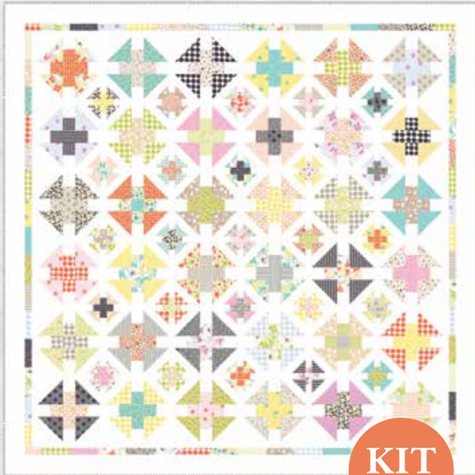
PS18170 - Sunny Days 71" x 71" LC & PP Friendly