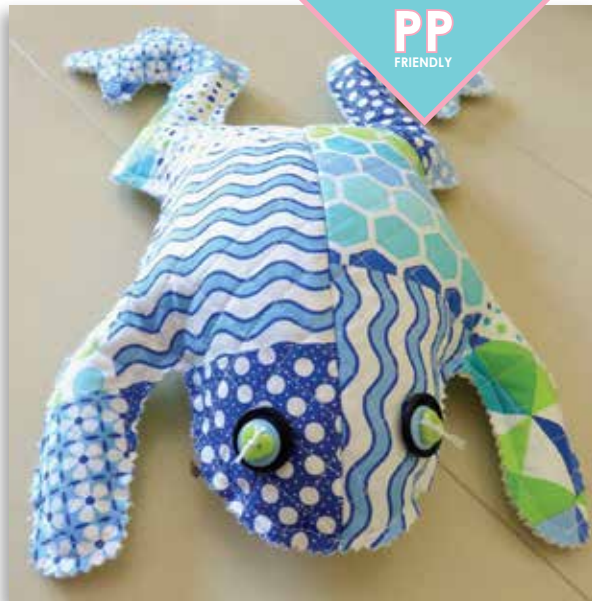
MMS 6060 / MMS 6060G Frog Patch Size: 16" Long

Our newest collection was created just to make you smile.