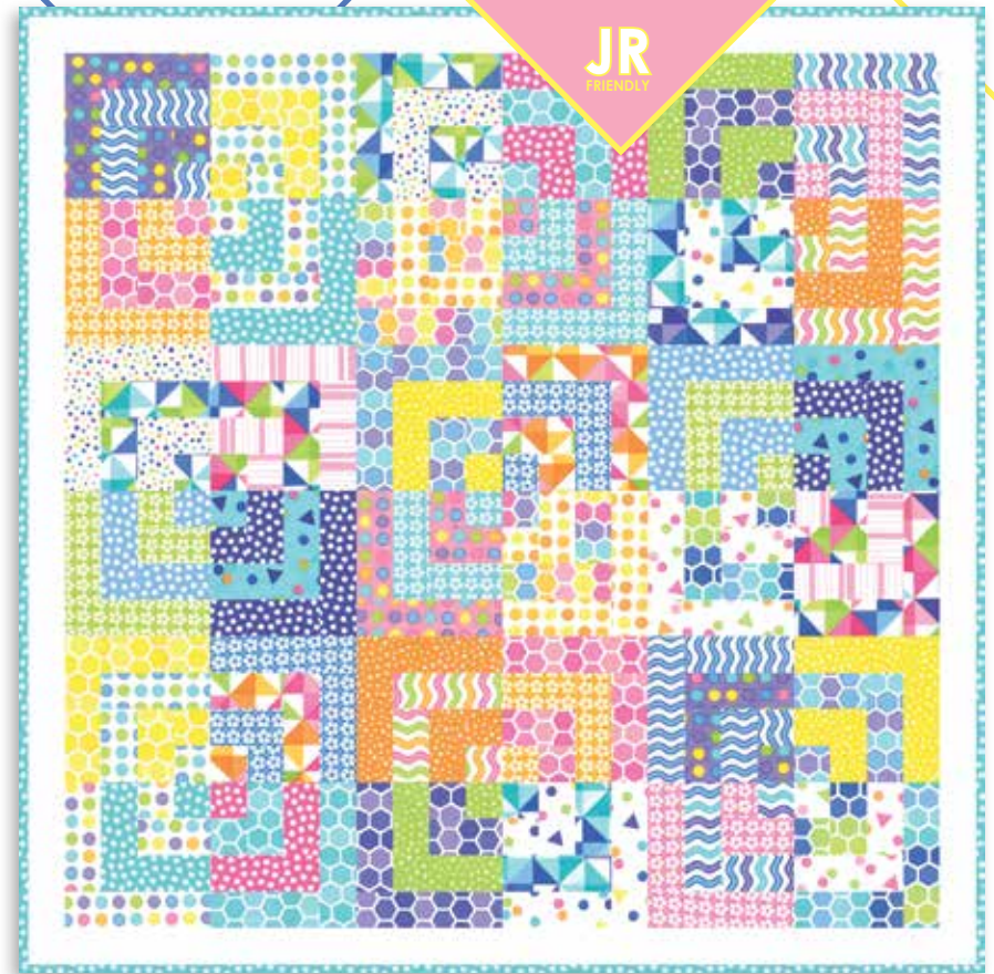
MMS 170524 / MMS 170524G Circus Size: 52" x 52"

It's a cheerful collection of polka dots, different types of stripes and hexagons – the perfect shapes for building your stash or creating a colorful new quilt masterpiece!